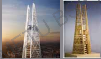
Figure 20 Lantern http://skyscrapercenter.com/building/lotte-world-tower/88